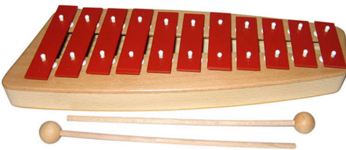
PEGL110 NG-10 11 notes