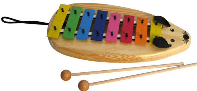
PEGL100 Mouse 8 notes

The typical characteristic of a Glockenspiel for kids is a special design with rounded edges and beautifully shaped holders for the strikers. Its sound is pure, perfectly suitable children's and adults' ears alike.