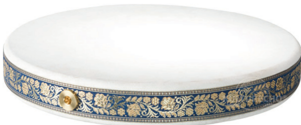
PEOD500 Natural skin