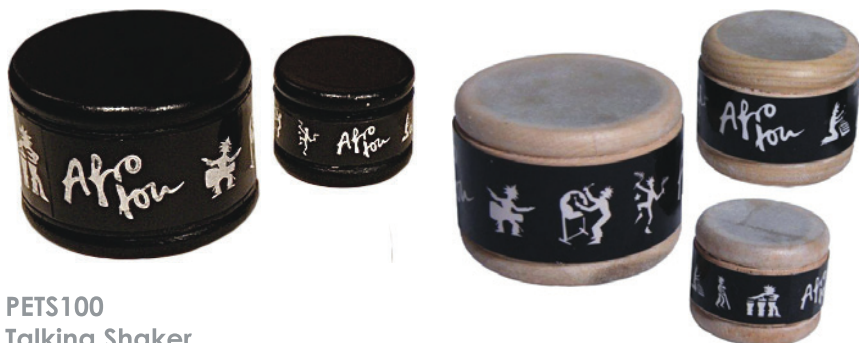
PETS100 Talking Shaker