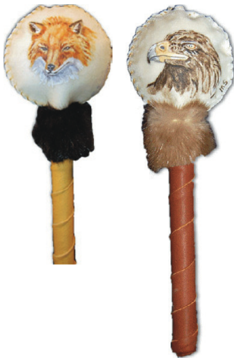
PESR400 PESR500 Shaman Rattles

A shaker or rattle is a simple but flexible and quite powerful tool that can be played with or without a drum. During healing ceremonies it helps to release blocked energy. The shaker moves, transforms and gets things going. Its sound can be varied easily, providing different results. According to its cultural surrounding the shaker offers a different form and use. It is an inseparable part of man and his rites. Some are decorated with feathers and pearls as we see with the Native Americans, others are skillfully carved from natural materials. The shaker always is an expression of man's creativity.