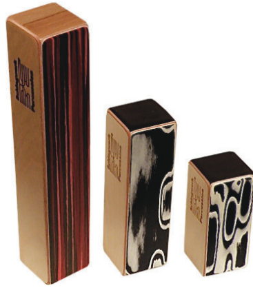
PESW100 wooden, large PESW101 wooden, medium PESW102 wooden, small