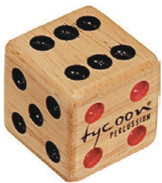
PEHW100 wooden cube