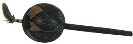
PESR100 Shaman Rattle, simple quality, carved