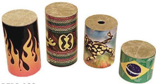
PEBR 100 Plastic