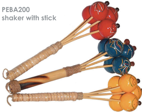
PEBA200 shaker with stick