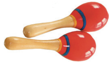
PEMA200 Maracas Mini