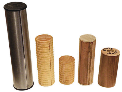
PESH200 metal tube PESH300 wooden, notched PESH700 wooden, plain