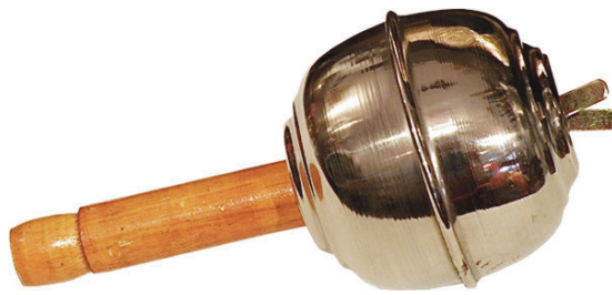
PECA100 Cabassa, Metal