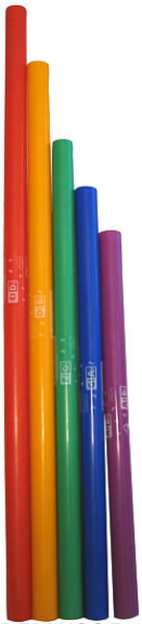
PEBW005 pentatonic 5-tone