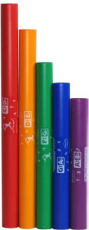
PEBW105 pentatonic 5-tone