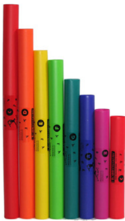
PEBW108 bass diatonic 8-tone