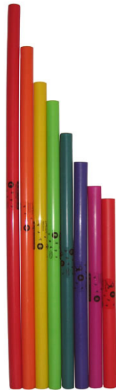
PEBW008 slide 8-tone