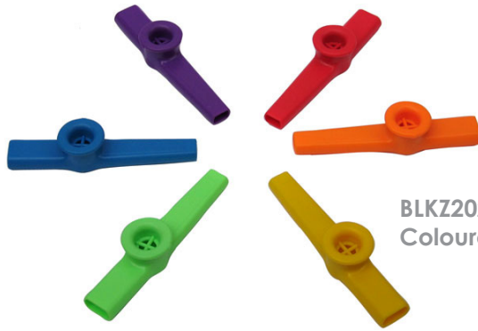
BLKZ202 Coloured Plastic