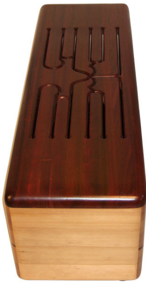
PEST300 Big Bom pentatonic 10-tone